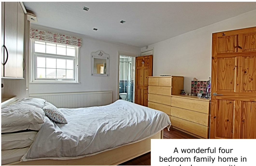
A wonderful four bedroom family home in a tucked away position in one of Tring's most popular roads.